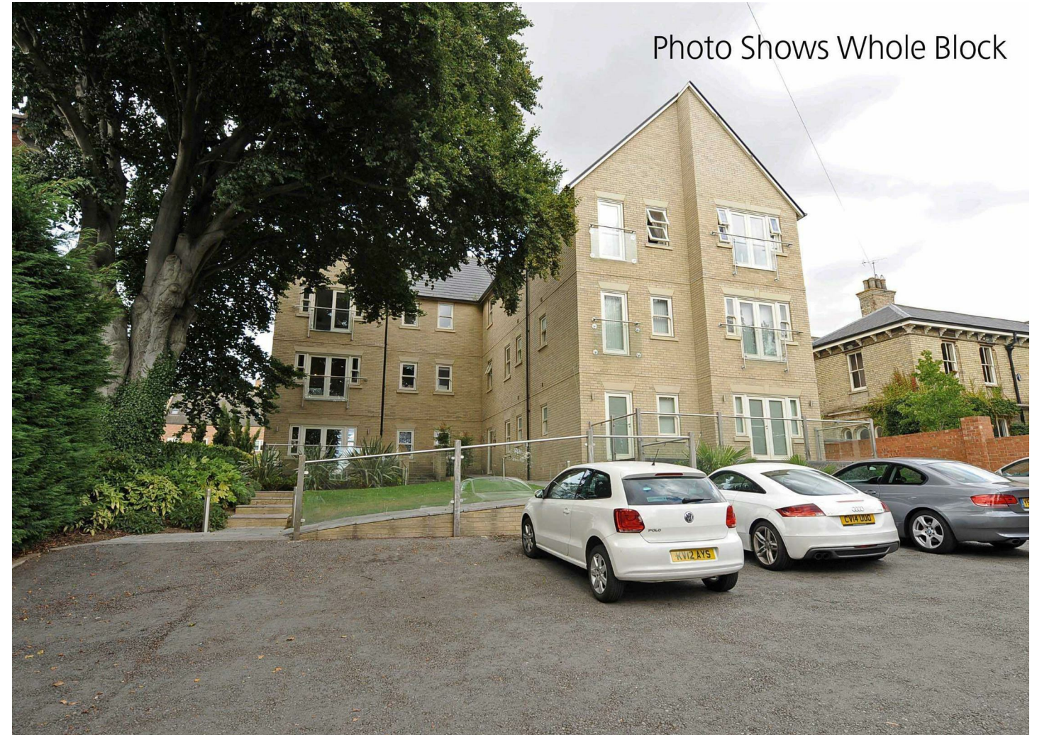
Photo Shows Whole Block

Flat 6, 183 Midland Road, Wellingborough, Northants, NN8 1NG